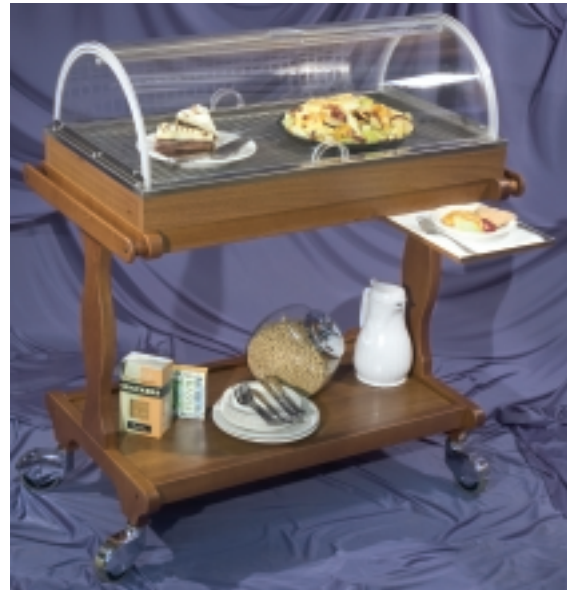
SCORPIONE cart shown with BAROQUE display