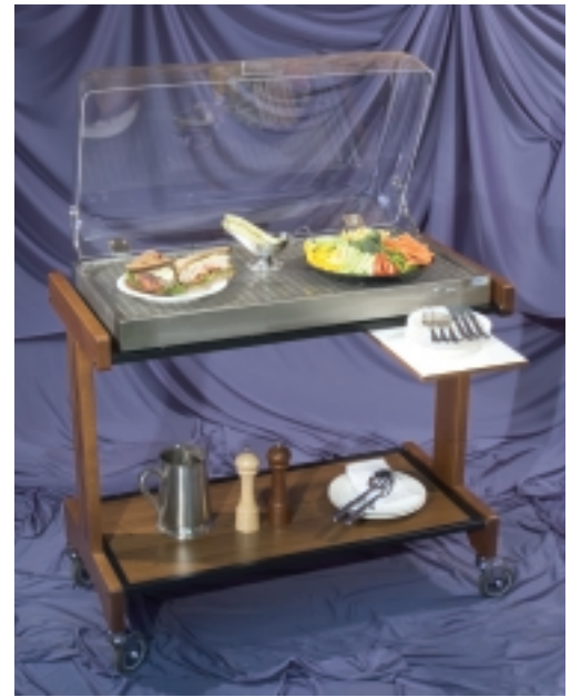
CLASSIC display shown on MINERVA cart